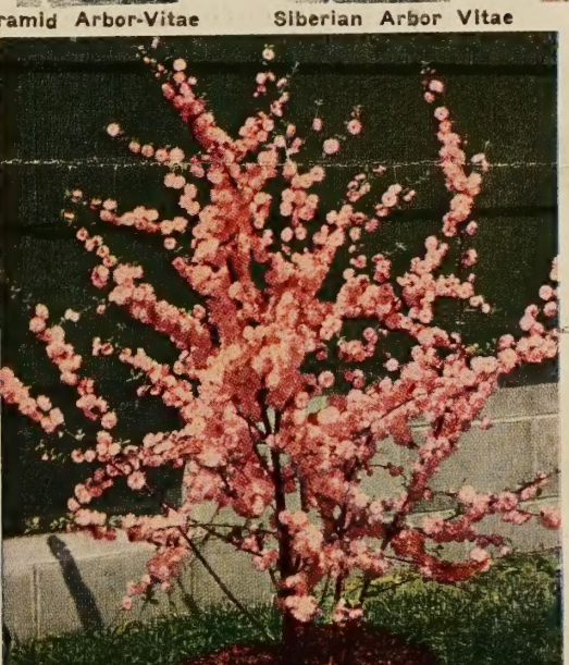
PINK FLOWERING ALMOND $1.65 each